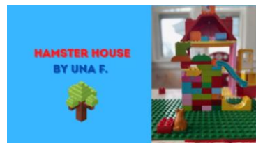
Virtual Story Time Programs