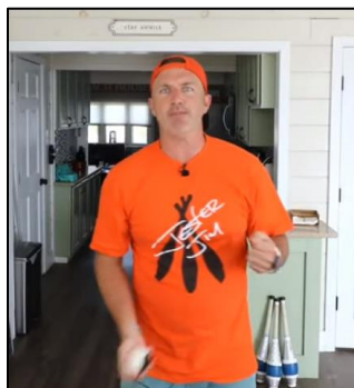
Virtual County Music Concerts with Tennessee Walt