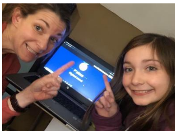
Halloween Pumpkin Contest October 2020